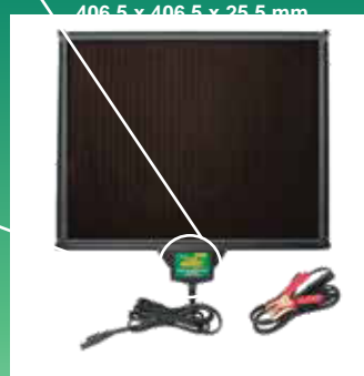
5 Watt Charger 270 mAmps Part#: 021-1163

The Worlds' 1st Solar Panel With Built-in Charge Controller