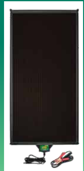
15 Watt Charger 830 mAmps Part#: 021-1165