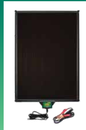
10 Watt Charger 540 mAmps Part#: 021-1164