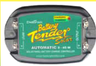
100,0 x 63,0 x 19,0 mm

Connects any solar panel to create a portable solar powered charger using Battery Tenders patented and proven charging algorithm. Designed to be used with ANY 5-45 watt non-Battery Tender solar panels.